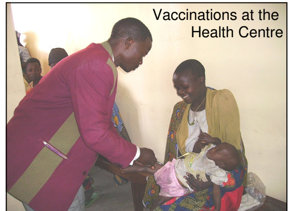
Vaccinations at the Health Centre