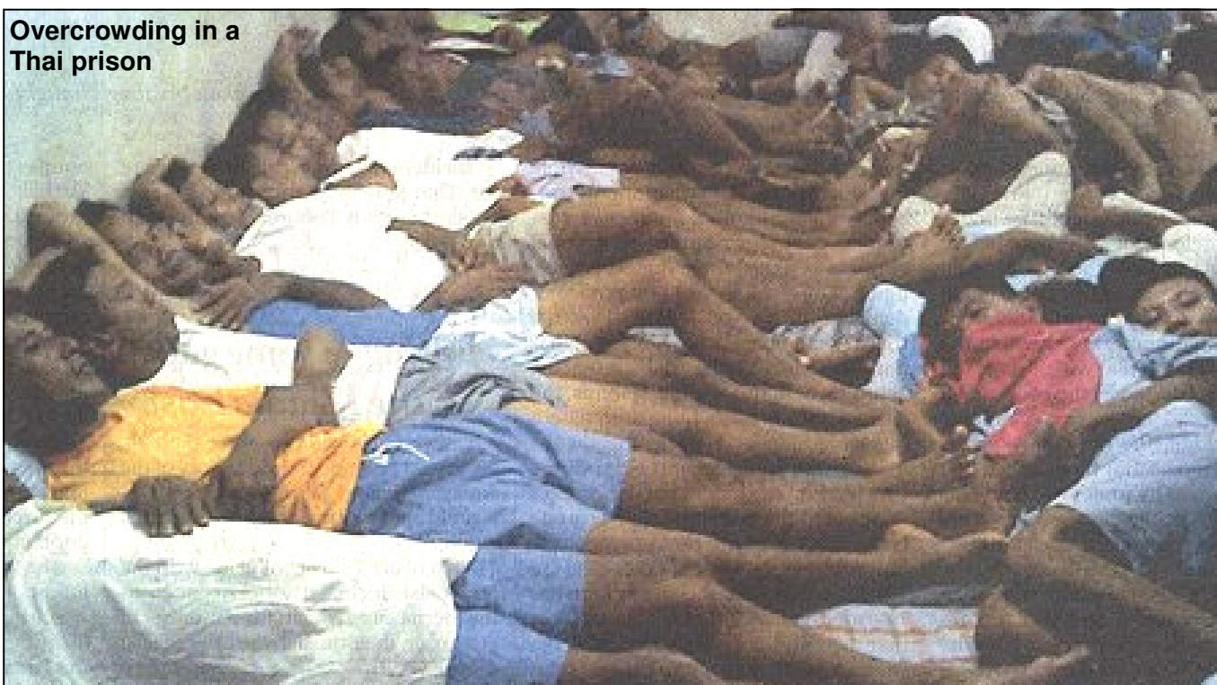
Overcrowding in a Thai prison

For more information on the Prison Ministry, please visit the Jesuits in Asia Pacific website at sjapc.net/content/committing-prison-ministry