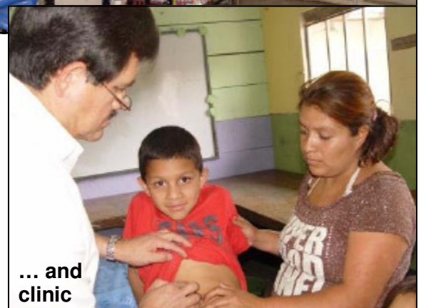
... and clinic

'Potter's House was so blessed to have received this special donation from the Parish of Hampshire Downs that is allowing us to provide these patients, and the ones referred from our own clinic, the opportunity to purchase their medicines.'