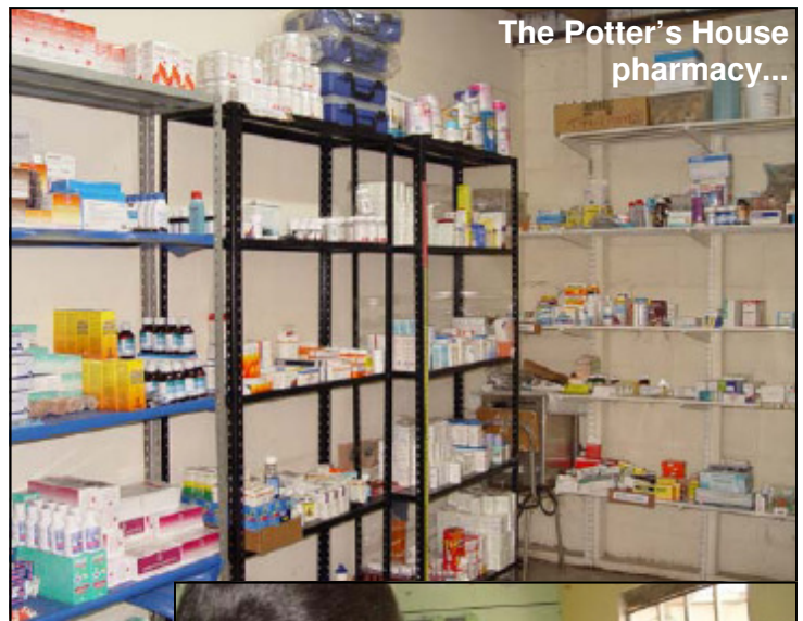
The Potter's House pharmacy...

In January, the CWP was able to send an additional £3,000 to Potter's House in Guatemala in support of their Health Program. Potter's House open their medical clinic three days a week, and on Fridays within the Guatemala City dump itself.