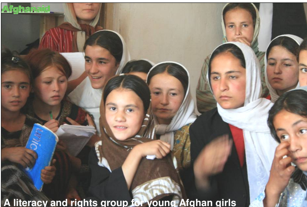
A literacy and rights group for young Afghan girls

Providing young girls with confidence and knowledge of their rights, and encouraging them to participate in community life, are crucial for the future of