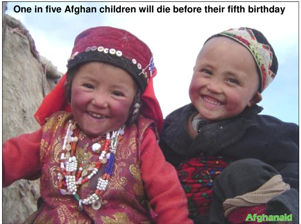
One in five Afghan children will die before their fifth birthday

Like children, women are excluded from many